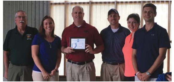
Service – HRG