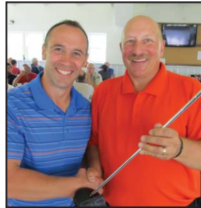
Terre Hill Putting Challenge Winner